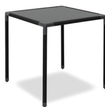
Black Rope with Anthracite Powder-coating and Glass.