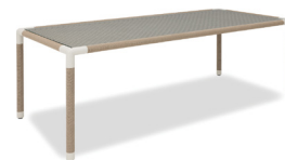
Taupe Rope with Pearl Powder-coating and Glass top.