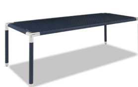
Blue Rope with EP Satinless Steel and Glass top.

This item is carefully packed one per box.