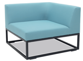
Aquamarine Fabric with Anthracite Powder-coating