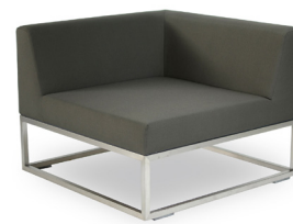
Slate Fabric with Brushed Stainless Steel

Slate Fabric with Anthracite Powder-coating