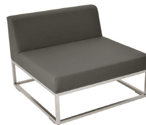
Slate Fabric with Brushed Stainless Steel

Slate Fabric with Anthracite Powder-coating