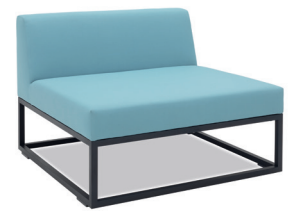
Aquamarine Fabric with Anthracite Powder-coating