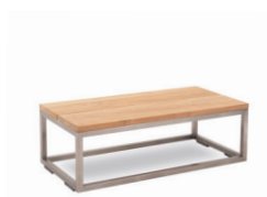
Teak top with Brushed Stainless Steel