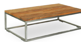
Teak top with Brushed Stainless Steel

Grey HPL top with Anthracite Powder-coating