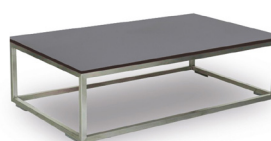
Grey HPL top with Brushed Stainless Steel