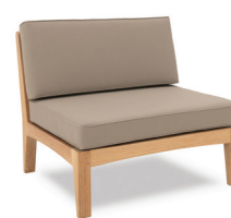
Teak with Taupe Rope and Taupe cushions.