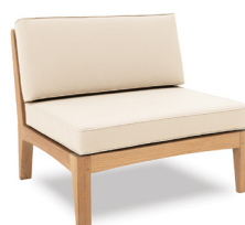
Teak with Taupe Rope and Natural cushions.

Teak with Taupe Rope and White cushions.