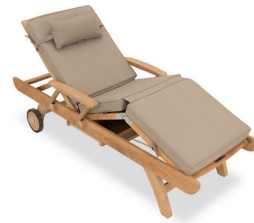
Teak with Taupe Cushion

This item is carefully packed one per box.