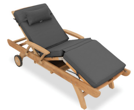
Teak with Slate Cushion