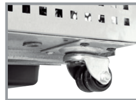
1 1/2" diameter dual swivel castors for "LP" models.