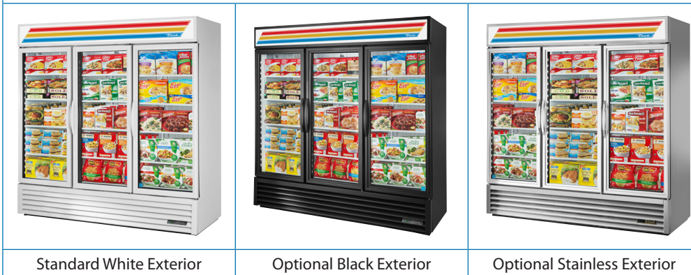
Standard White Exterior