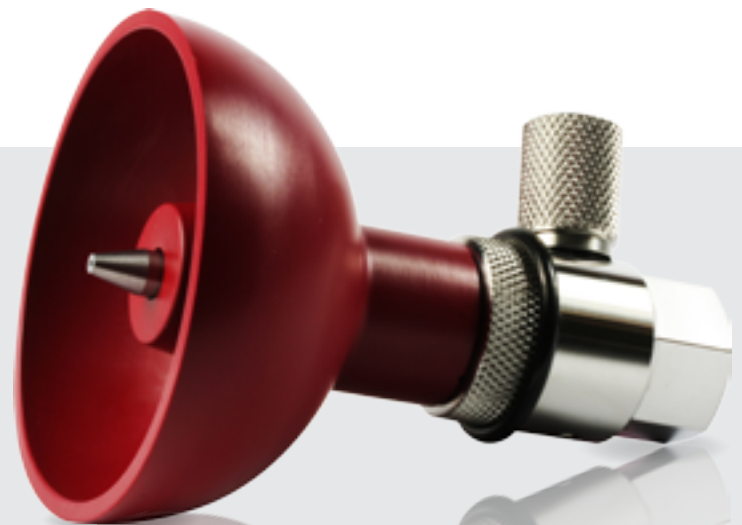
DiaLine shown with 3/16" (0.5 cm) inlet, 3" (7.6 cm) nozzle, and protective spray guard.