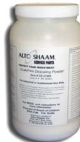
Alto-Shaam CE-27889 4 lb Scale Free™ Delimer - Citrus Based, Non Corrosive Write a Review! KaTom #: 139-CE27889 • MPN: CE-27889