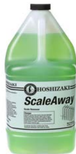
< Delimer / Descaler Hoshizaki SCALEAWAY 1 Gallon Scale Remover Item #: 415SCALEAWAY

Quantity Discounts: Buy in lots of 4: $72.99/Each