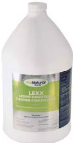
Vollrath 265003 LEXX™ Liquid Sanitizer & Cleaner Concentrate Write a Review! KaTom #: 175-265003 • MPN: 265003