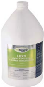
Vollrath 265003 LEXX™ Liquid Sanitizer & Cleaner Concentrate Write a Review | KaTom #: 175-265003 • MPN: 265003