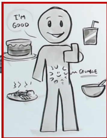
Isaiah 58:6 SELF-CONTROL

And if thou draw out thy soul to the hungry and satisfy the afflicted soul; then, shall thy light rise