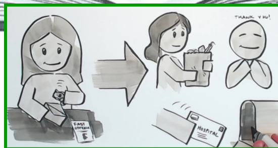
Isaiah 58:7 FAST OFFERING