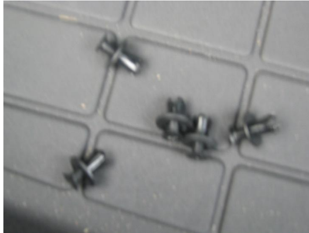
^ Picture of the plastic screws removed.