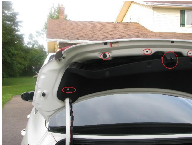
^ Picture of plastic screws removed and trunk liner slide off latch and bumpers.