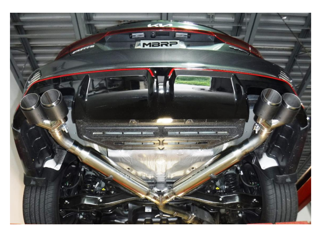
Congratulations! You are ready to begin experiencing the improved power, sound and driving experience of your MBRP Performance Exhaust. We know you will enjoy your purchase!

7. Carefully align the system, centering the Tips with the factory fascia openings. Align the edge of each band clamp with the edge of the joint it is connecting. Tighten all hardware and clamps, starting at the front and working rearward to secure the system. Check along the full length of the exhaust system to ensure there is adequate clearance for fuel lines, vent lines, brake lines, frame, bodywork, suspension and any wiring, etc. If there is any interference detected, relocate or adjust to provide adequate clearance. Ensure all clamp connections are secure and components are unable to rotate or slide. Band clamps require approximately 45 lb-ft (60 N-m) of torque. Verify clearances, system security and band clamp torque after 30-60 miles (50-100 km) of driving.