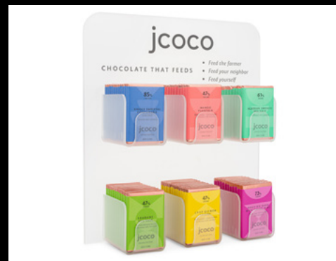
jcoco acrylic counter display