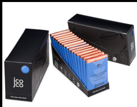
jcoco 1oz bar 15ct case pack