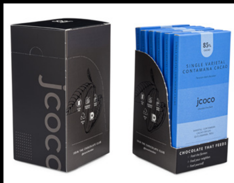
jcoco 3oz bar 6ct case pack