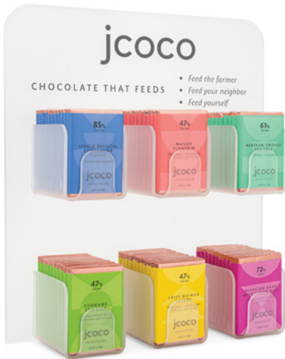
jcoco 1oz acrylic display 6 bar facings, 10 bars per facing