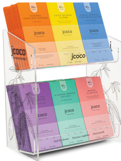
jcoco 3oz acrylic display 6 bar facings, 6 bars per facing