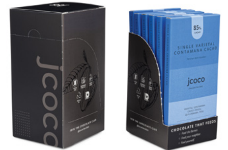
jcoco 3oz bar 6ct case pack