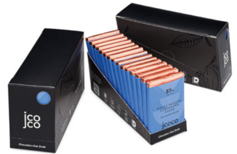
jcoco 1oz bar 15ct case pack