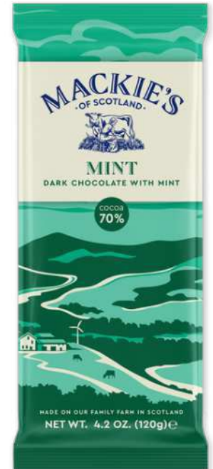
Mint Dark Chocolate 15 x 4.2oz 5012262010968