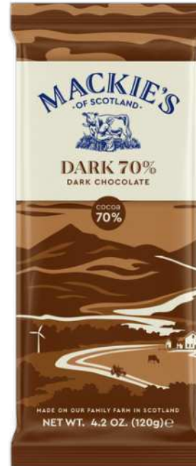
Dark 70% Chocolate 15 x 4.2oz 5012262010951