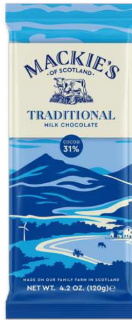
Traditional Milk Chocolate 15 x 4.2oz 5012262010937