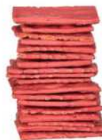
Beetroot & Garlic Cracker