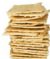
Leek & Caerphilly Cheese Cracker