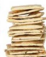
Szechuan Pepper, Fennel & Red Onion Cracker