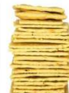
Chilli, Ginger & Garlic Cracker