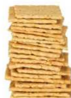
Lemongrass, Coconut & Chilli Cracker