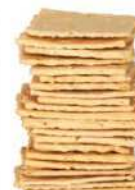
Cheddar & Onion Chutney Cracker