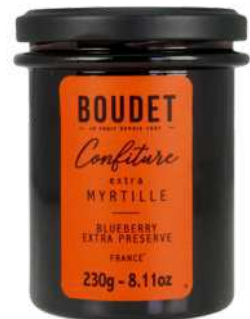
Blueberry 6 x 8.11oz 812655000034