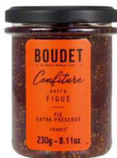
Fig 6 x 8.11oz 812655000041