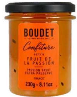
Passion Fruit 6 x 8.11oz 812655000065