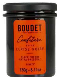
Black Cherry 6 x 8.11oz 812655000010