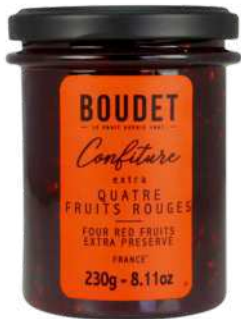
Four Red Fruits 6 x 8.11oz 812655000058