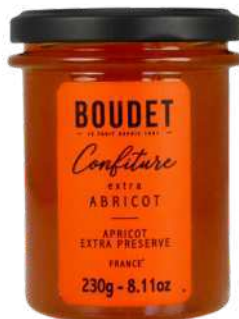
Apricot 6 x 8.11oz 812655000003