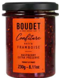
Raspberry 6 x 8.11oz 812655000096