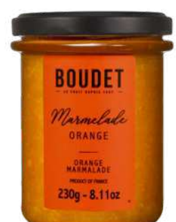
Orange Marmalade 6 x 8.11oz 812655000102