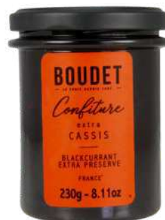
Black Currant 6 x 8.11oz 812655000027