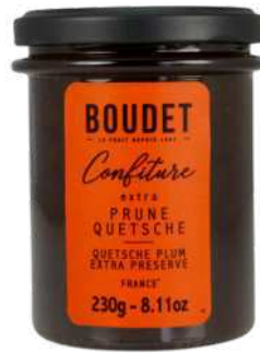
Quetsche Plum 6 x 8.11oz 812655000072