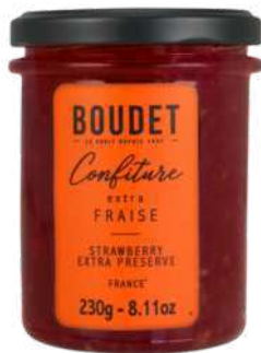
Strawberry 6 x 8.11oz 812655000089