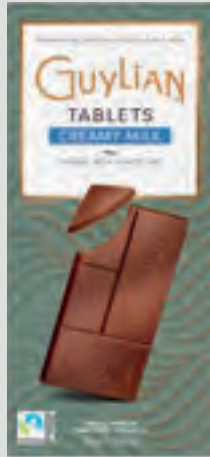
Creamy Milk 100g/3.53oz GL828