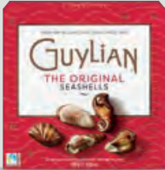
Holiday Seashells 22-piece 250g/8.8 oz. case of 12/case with RED Holiday Sleeve GL314