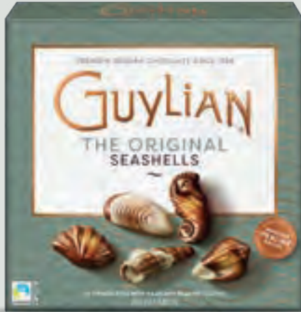
22-piece window box 250g./8.8 oz. 12/case GL214