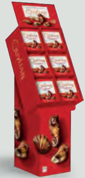
Holiday Seashells 22-piece gift boxes in RED Holiday Sleeve; 48 box DISPLAY GL414