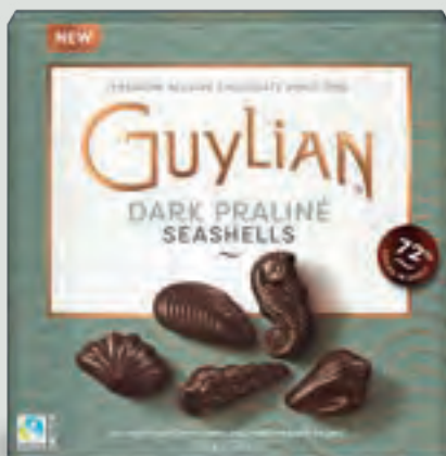
20-piece 225 gr/ 8.8 oz. 12/case GL235

The Dark Praliné Seashells combine the original artisanal recipe of in-house roasted hazelnuts with intense dark chocolate. This is then delicately covered in a 72% cocoa shell, for a flavor to remember.