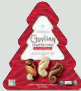
Holiday Guylian's Temptations Mix 10-piece Assortment RED Holiday Tree Pack. 96g/ 3.39 oz. 12/case GL637