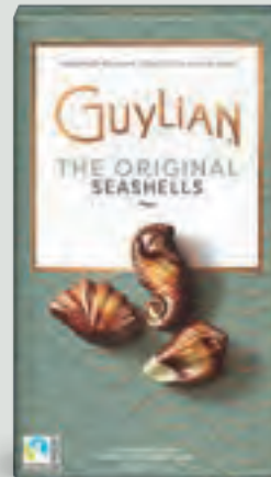
11-Piece 125 gr/ 8.8 oz. 12/case GL321