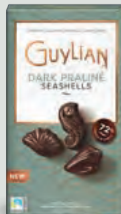
10-Piece 112 gr/ 8.8 oz. 12/case GL236