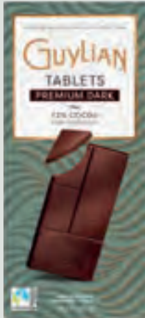
Dark 72% 100g/3.53oz GL826

100g: sugar based portion pack 0.88oz. (25 gram): luxury tablets for self indulgence for all Tablets: 12/case