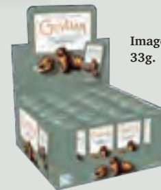
Image of display 33g.