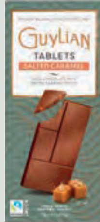
Salted Caramel 100g/3.53oz GL840

Explore Guylian tablets with reduced sugar content, using stevia-based sweeteners, with an outstanding quality.