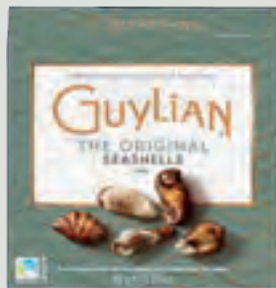
6-piece 65g/ 2.29oz. 24/case GL296