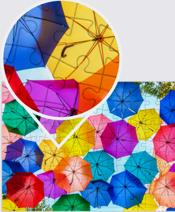
Produced with: TECHNI-PRINT® EZP