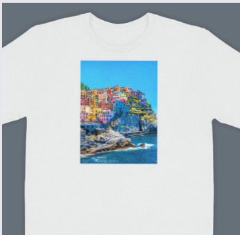
Produced with: TECHNI-PRINT® EZP