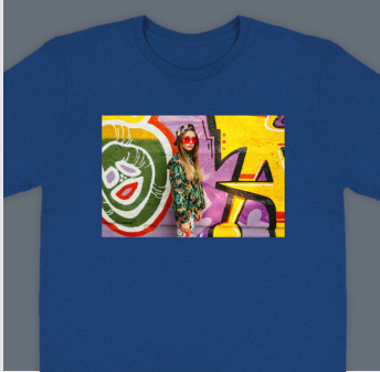
Produced with: LASER-1-OPAQUE®