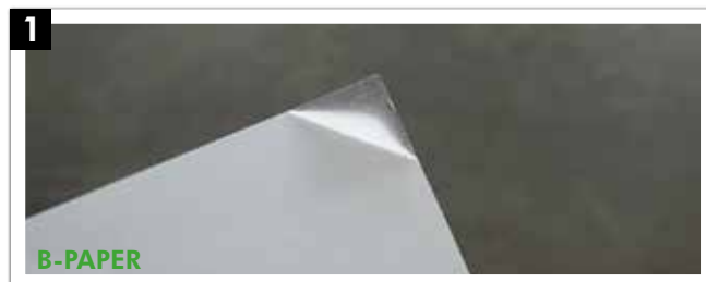
1 Peel off a corner of the white backing paper from the B-Paper and fold it over.

B-PAPER – GLUE The B-Paper has a matt and glossy side. The matt side is the backing paper and it will be disposed of after peeling it off from the foil.