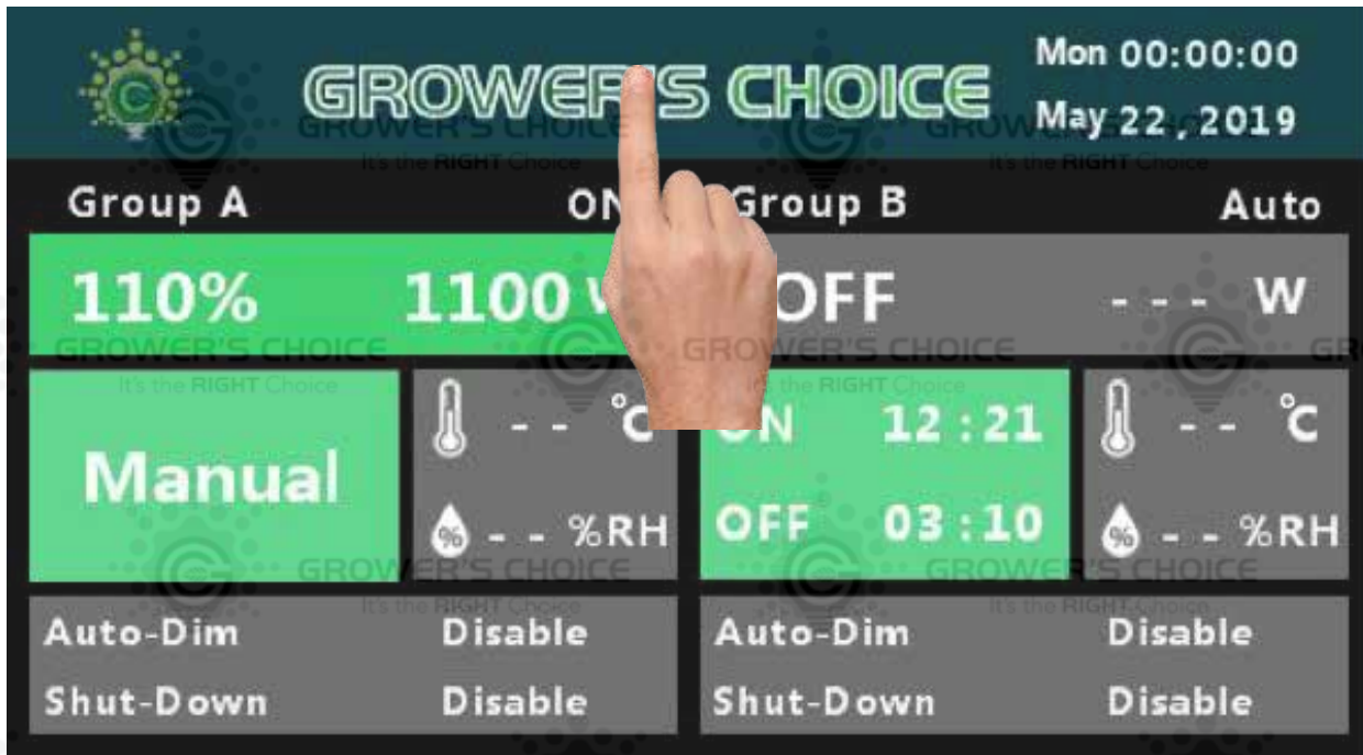
Touch the Grower's Choice banner to access Main Menu