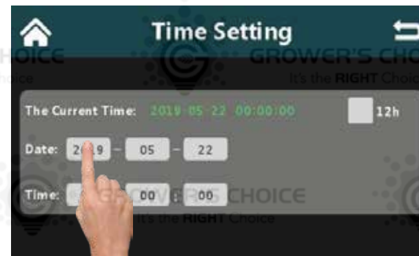
Touch Date options to set master controller date