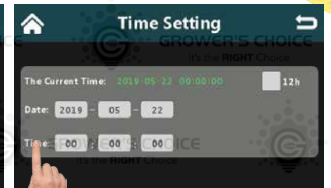
Touch Time options to set master controller clock