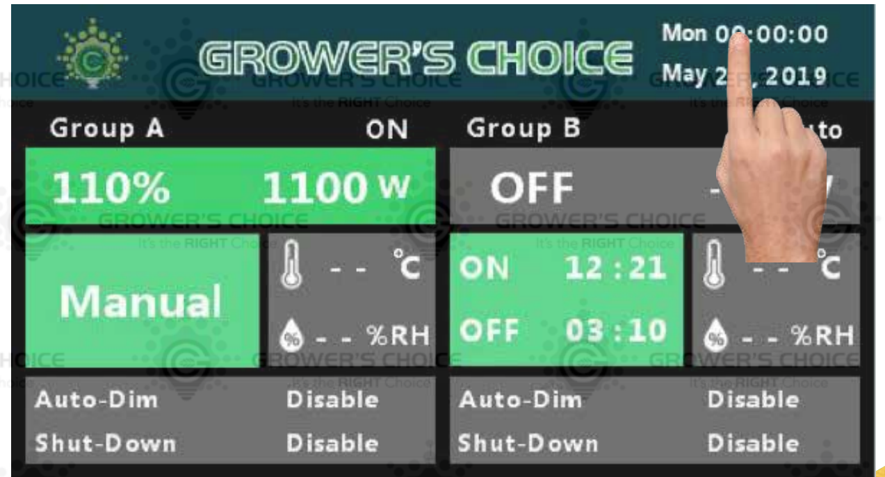
Touch the date and time for access to the controller clock calendar