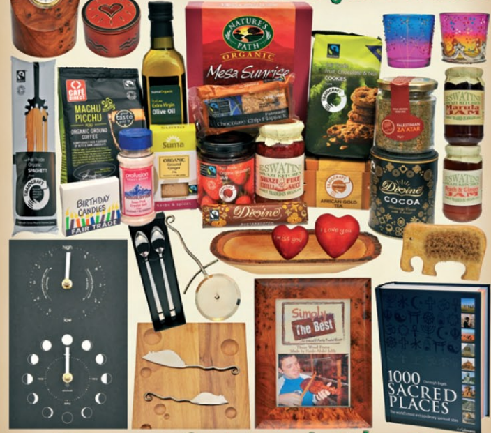
- Home & Food Stuff - - Kids' Stuff -

Eco-Friendly scarves made from banana, pineapple and other organic fibres