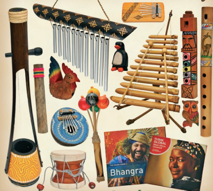
- Musical Stuff - - Sparkly Shiny Stuff -