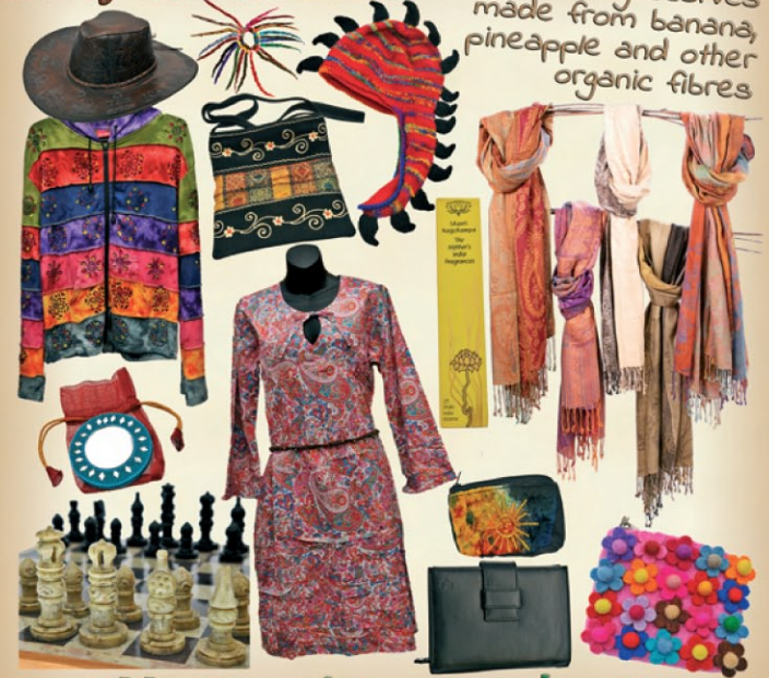
- All Kinds of Stuff - - Crafty Stuff -