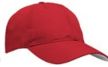
22 Dark Red