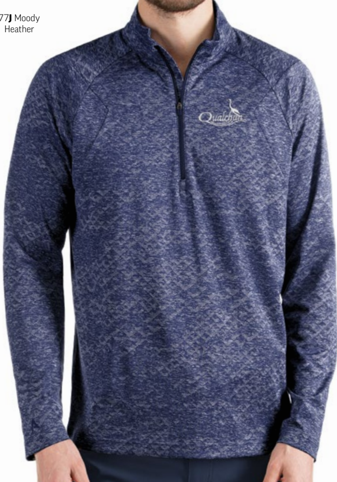
77J Moody Heather