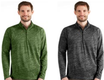
094 Black Heather