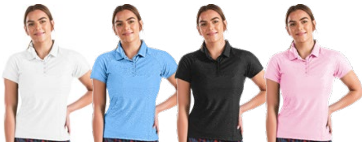
25P Desert Pink