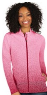
35P Desert Pink/Rumba