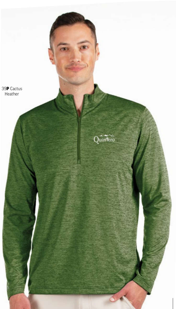
39P Cactus Heather