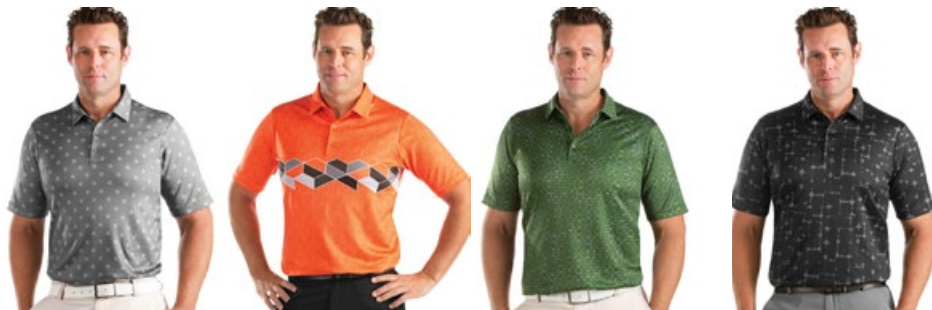
201 Black Multi