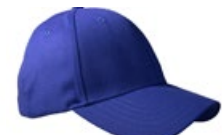
56 Dark Royal