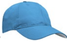
344 Columbia Blue