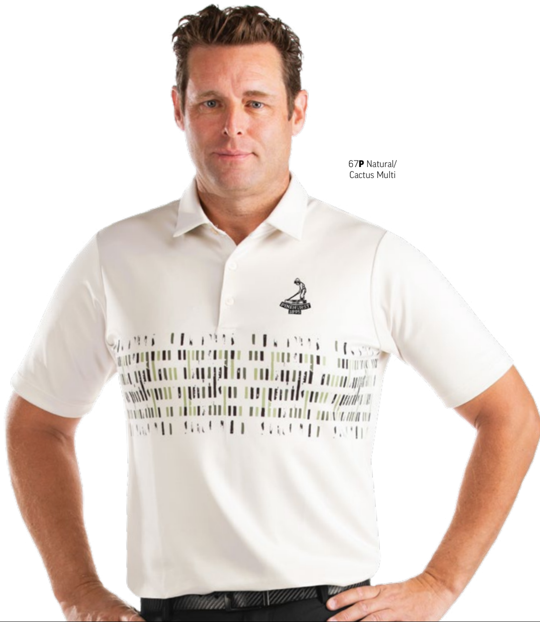
67P Natural/ Cactus Multi