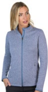
*80G Medium Denim Heather Multi