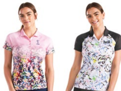
226 White/ Black Multi