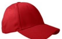
22 Dark Red