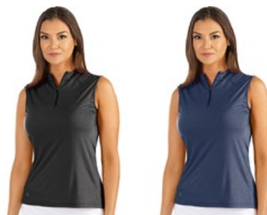
24P Moody Heather/Brook