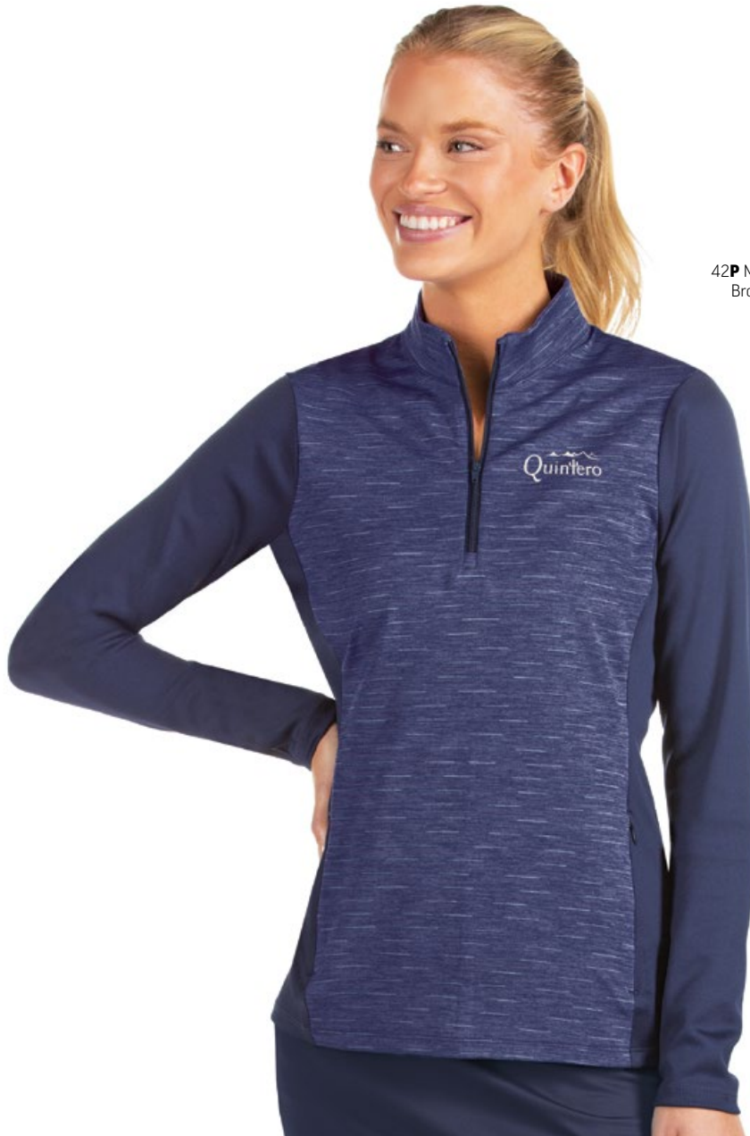
42P Moody Hthr/ Brook Multi