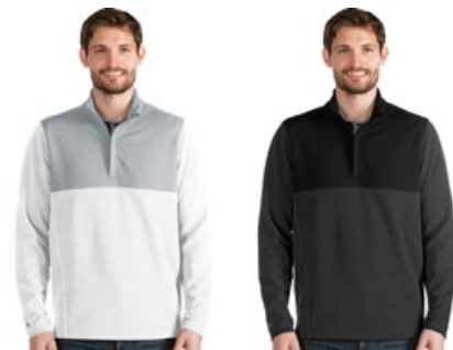
201 Black Multi