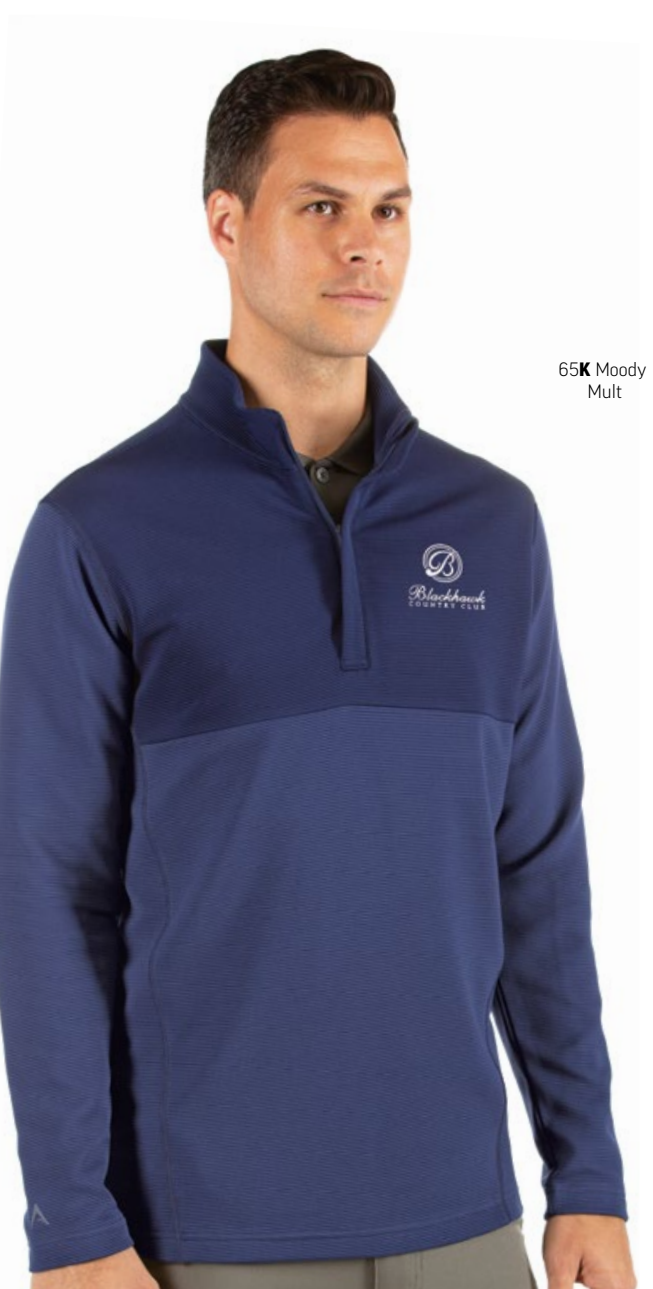
65K Moody Mult