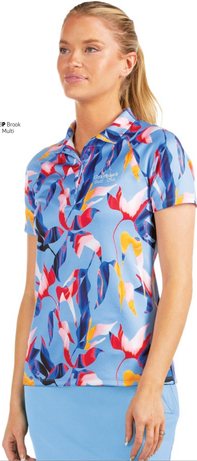
43P Brook Multi