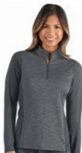
830 Black Heather Multi