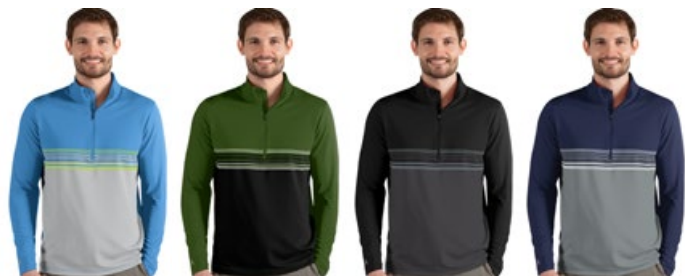
45N Navy/ Skyscraper/White