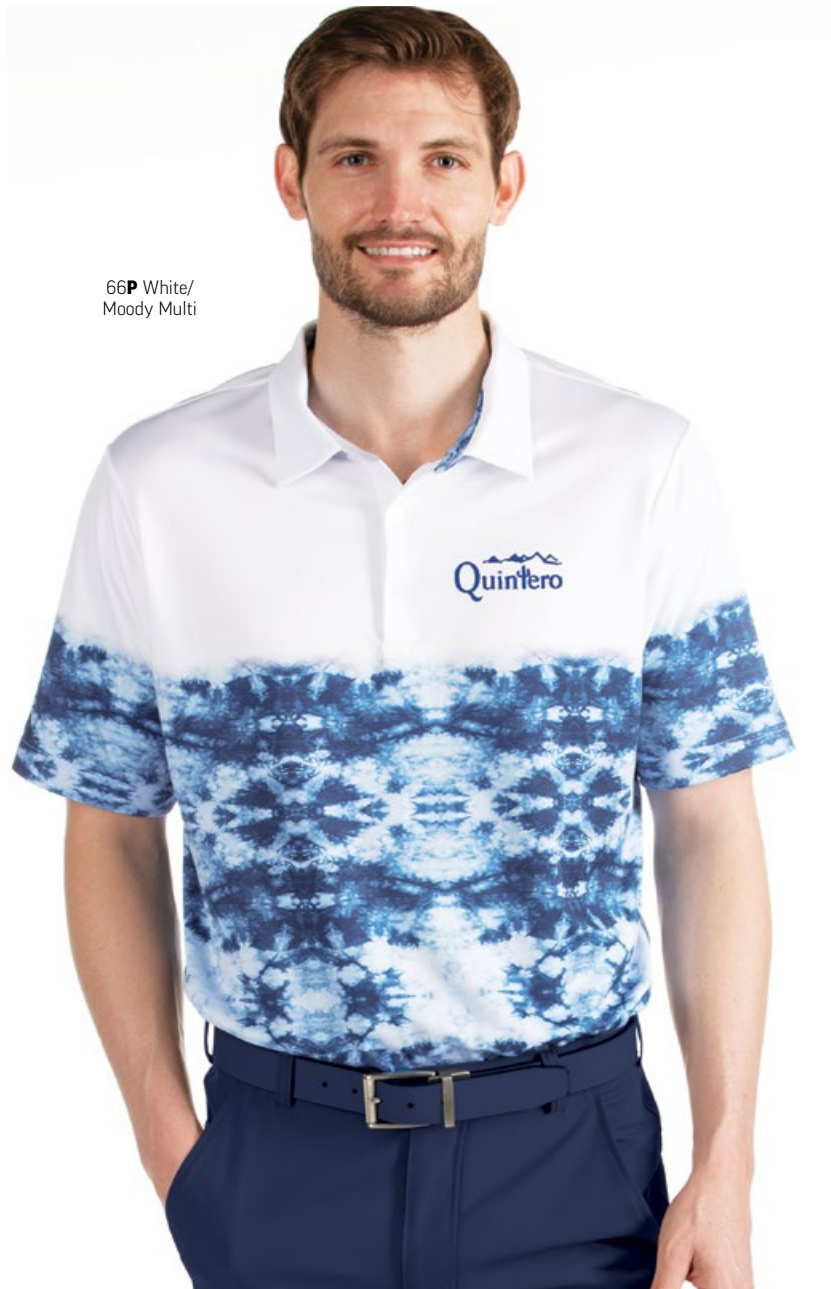
66P White/ Moody Multi