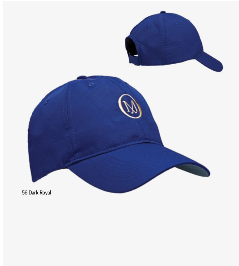
56 Dark Royal