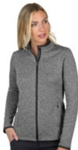
*830 Black Multi