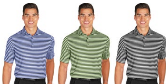
185 Black/ White