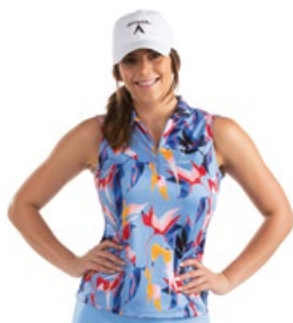
43P Brook Multi