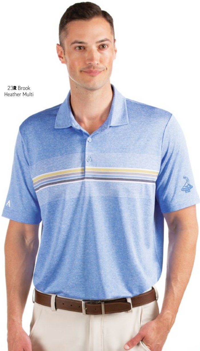
23R Brook Heather Multi