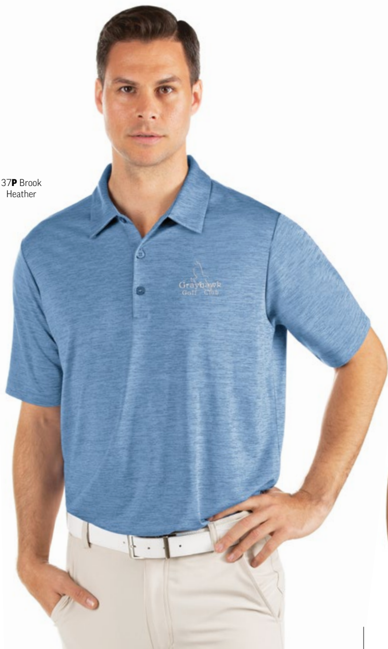
37P Brook Heather