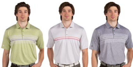
201 Black Multi