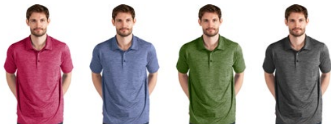
094 Black Heather