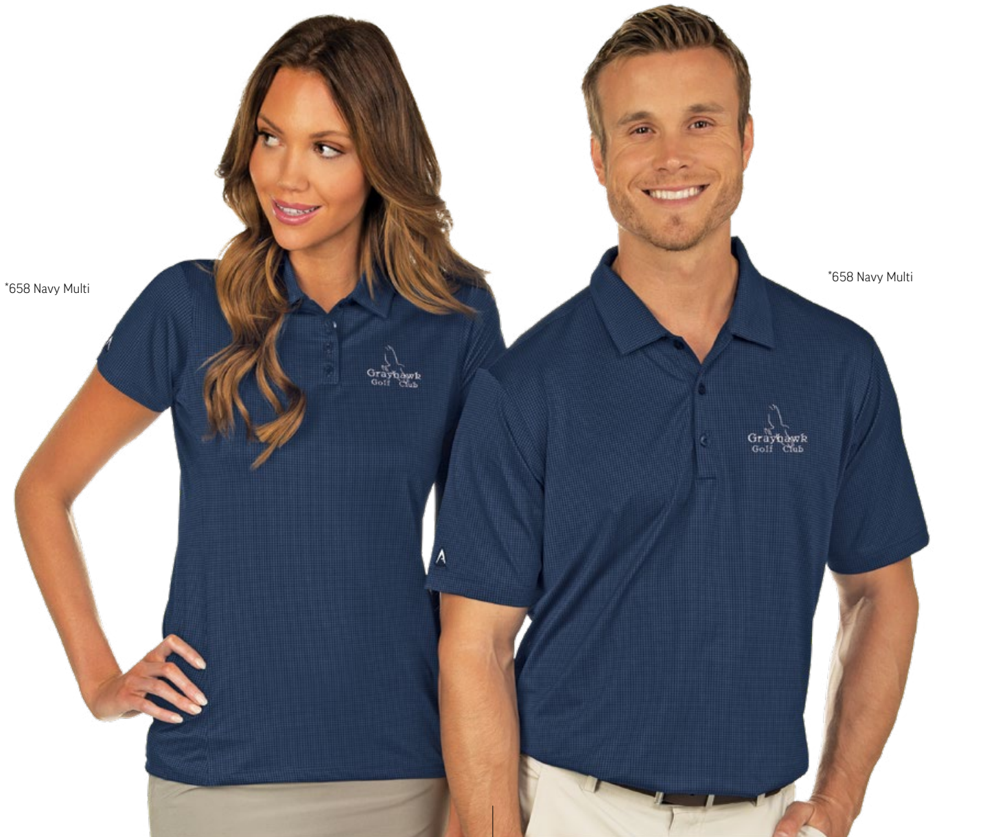
*658 Navy Multi