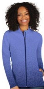
36P Brook/ Moody