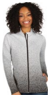
222 White/ Black