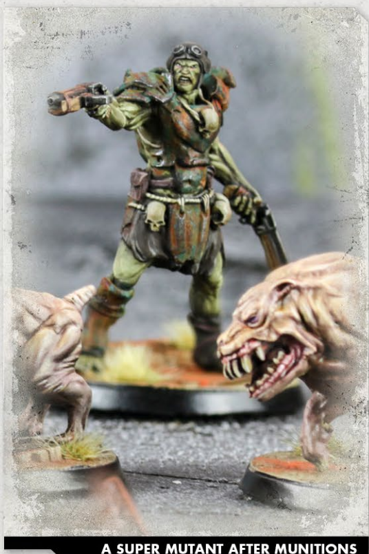
A SUPER MUTANT AFTER MUNITIONS