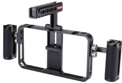
Universal Phone Cage Rig Kit with Handles Instruction Manual