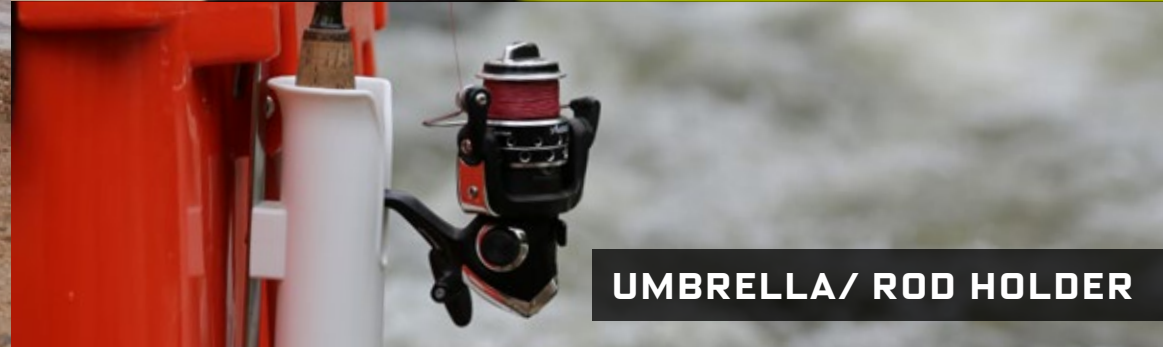
UMBRELLA/ ROD HOLDER