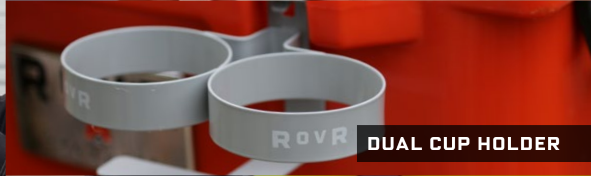
DUAL CUP HOLDER