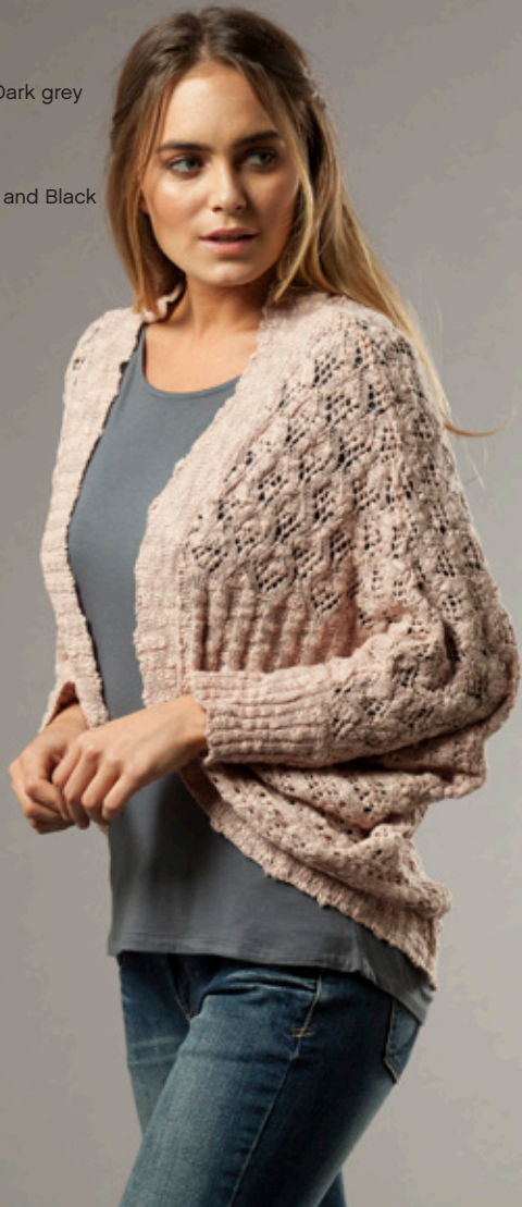
Michelle Top MI301W17 Grey, Dusty Rose and Black