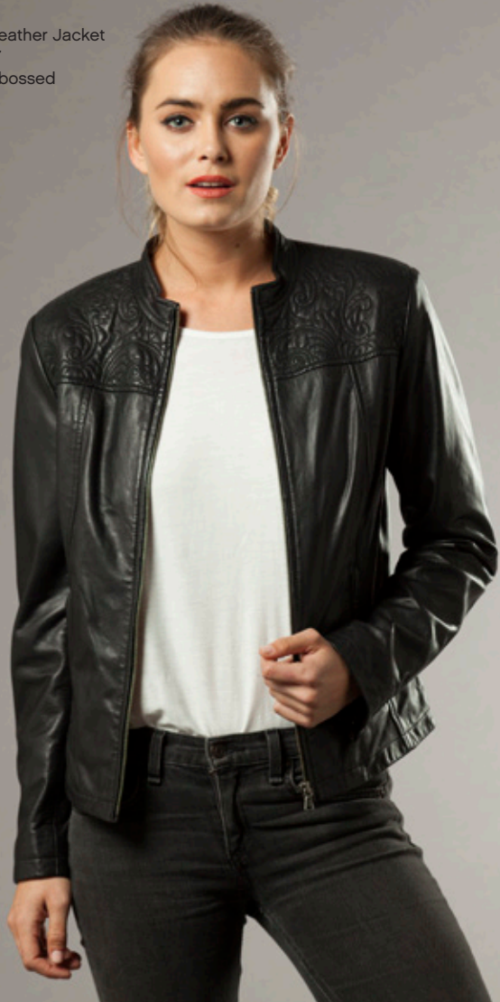
Jessica Leather Jacket JE407W17 Black Embossed