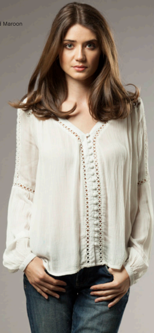
Yvonne Top YV29W17 Off White and Maroon