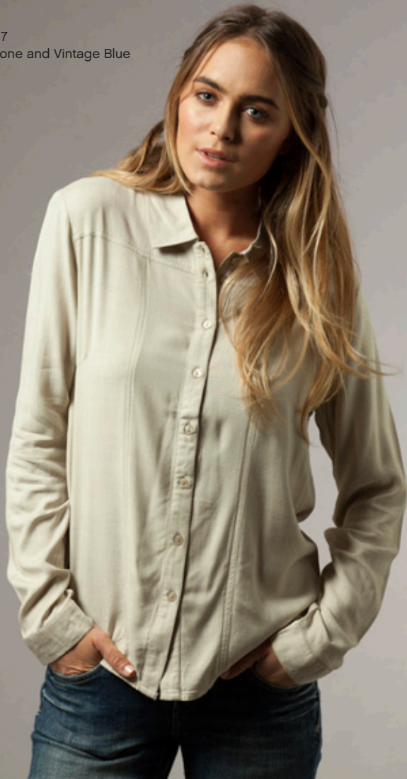
Svea Top SV0280W17 Pumice Stone and Vintage Blue