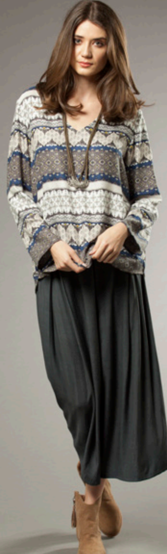
Anika Necklace AN416W17 Morel, Rose Smoke, Pumice Stone, Tibetan Red, Vintage Blue, Asphalt and Black