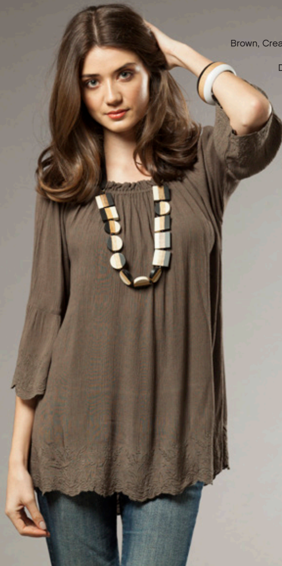
Lovisa Top LO0301W17 Brown, Cream and Asphalt