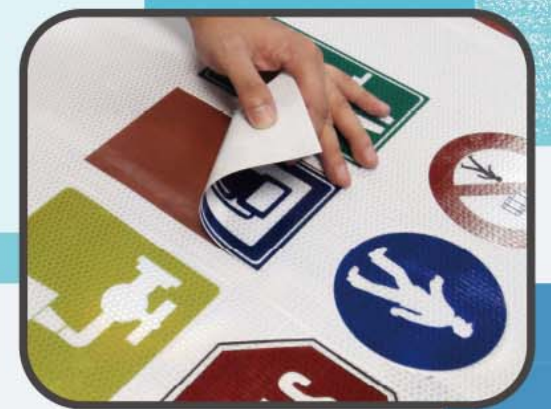
▶ Reflective Film / Sandblast Film