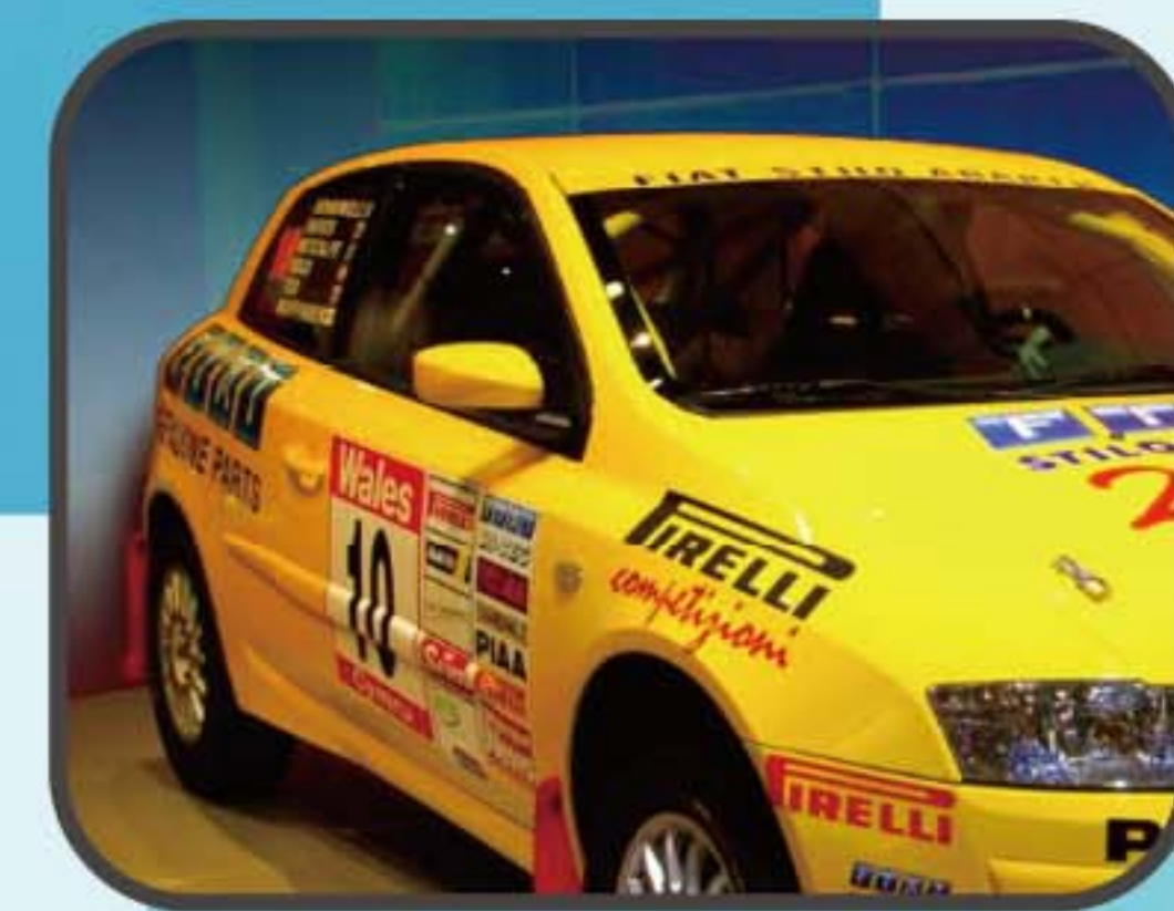
▶ PVC Vinyl / Window Tint Film/Paint Protection Film