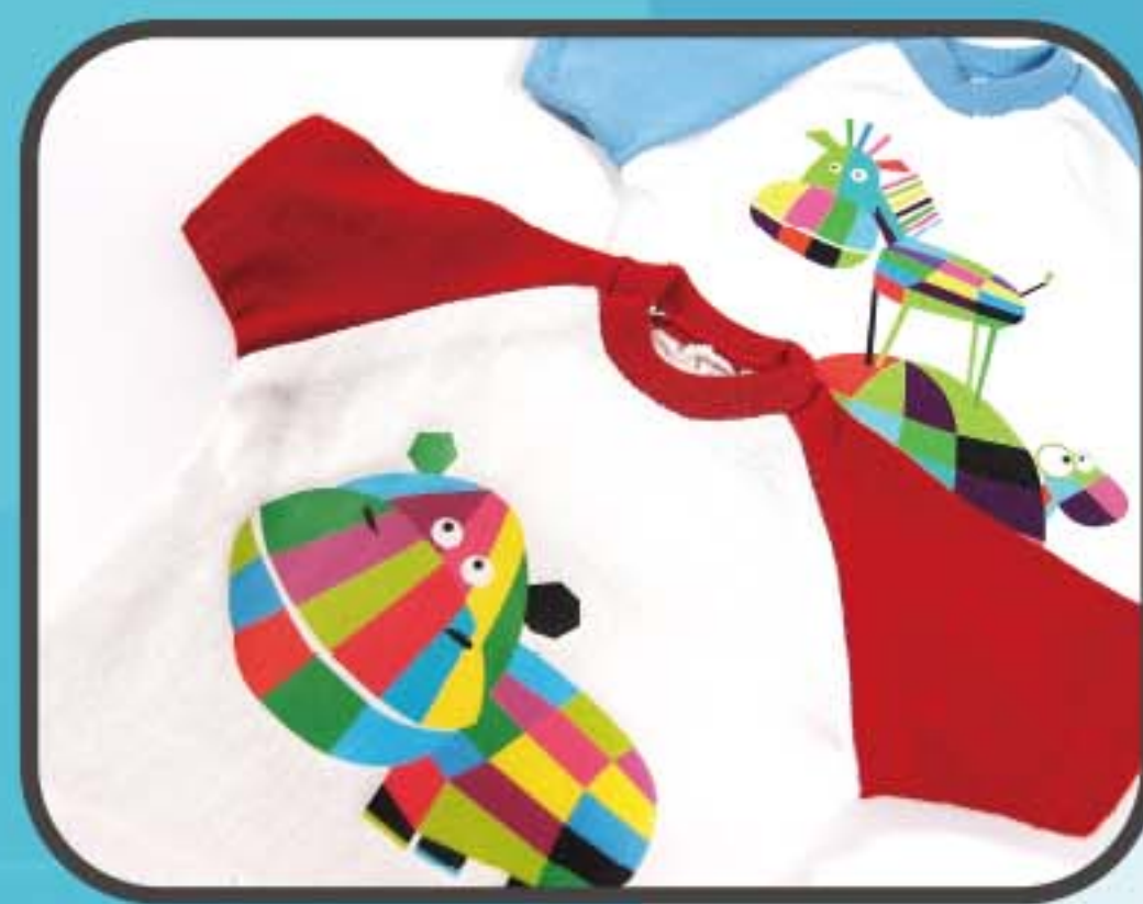
▶ Heat Transfer Film