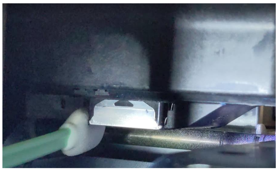
Video: <a href="https://youtu.be/guHJsUuN5iw">https://youtu.be/guHJsUuN5iw</a>

In addition to the DAILY PROCEDURE, approximately once a week (depending on how much printing you're doing, less frequently needed if you print less often), you should also <u>clean around the edges of</u> <u>the printhead</u> with the De-Plasticizing Solution