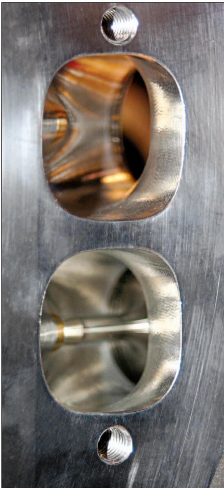
These exhaust ports are CNC-finished to a tight standard.

pushrod doesn't seem to make much difference in the RPM capability of the engine.