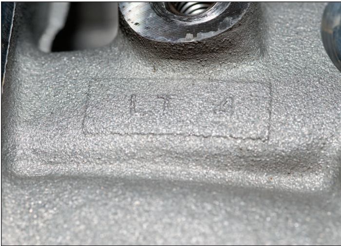
The LT4 head is cast with a mark to distinguish it from the LT1 head. This can help you identify the motor more quickly if you are rummaging through the junkyard.