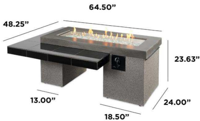
UPT-1242 445 LBS