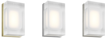
brass (aged brass not shown)