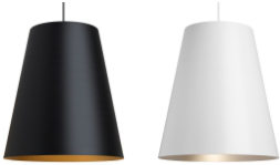
black / satin gold white / satin haze