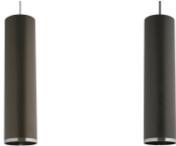
brown chestnut weathered gray oak