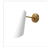
WV572205WHAG Aged Gold/White

*For complete warranty terms, please visit: www.aloralighting.com/warranty