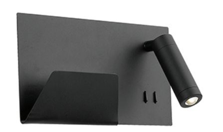
BK - Black