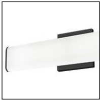
BK - Black