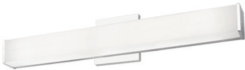
CH - Chrome