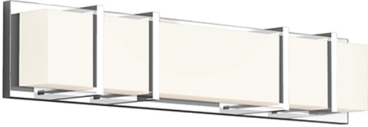
CH - Chrome