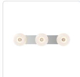
VL57532-CH/OP Chrome/Opal Glass