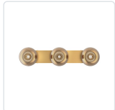
VL57532-BG/CP Brushed Gold/Copper

The stunning blown glass shades of the Samar Collection make wonderfully versatile statement pieces or subtle lighting options. The three ombre finishes are gorgeous specimens available in various hanging options that help create a dynamic space through lighting and tone. Each glass finish has three fixture finishes that help create an exciting piece for a unique space in your home.