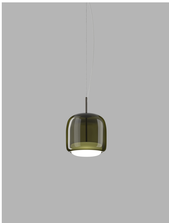
JUBE SP P VABC NEO L22 CE