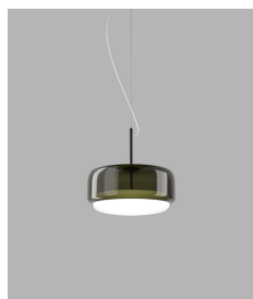
JUBE SP G