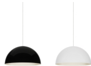
High Gloss Black/ White