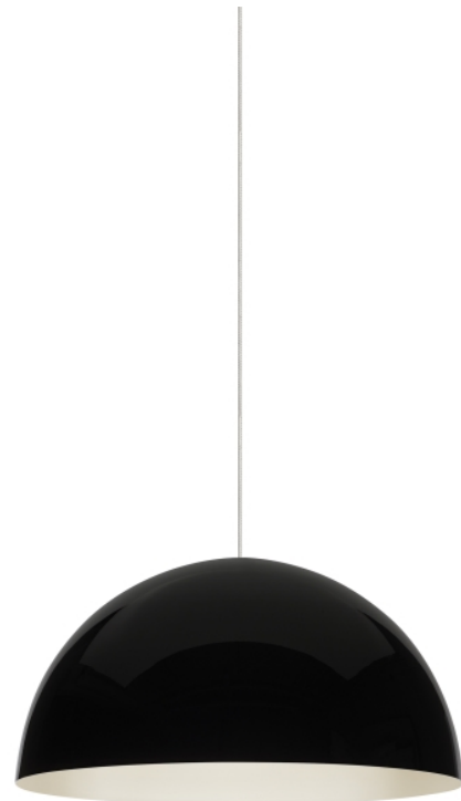
High Gloss Black/ White

Includes 12 volt 5.8 watt, 221 delivered lumen, 3000K, integrated LED module. Dimmable with low-voltage electronic or magnetic dimmer (based on transformer). Includes 6 feet of field-cutttable cable to match finish selection.