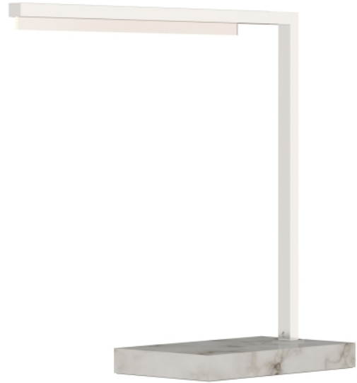
Polished Nickel/ White Marble