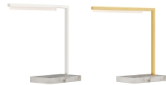
Polished Nickel/ White Marble