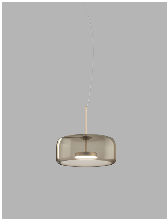
JUBE SP 1 G FUTR OS L22 02 CE