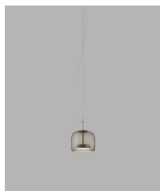
JUBE SP S