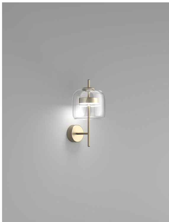
JUBE AP S CRTR OS L22 14 CE