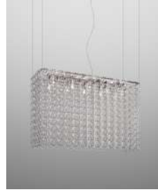
GIOGA SP RE1