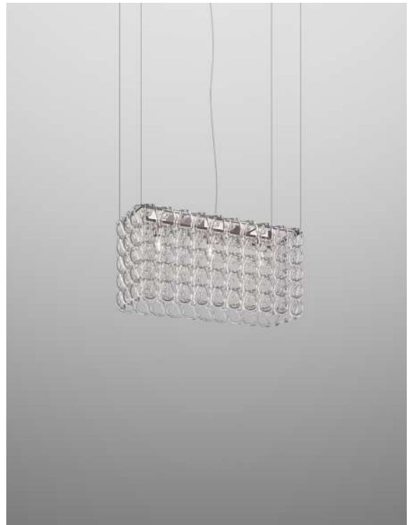
GIOGA SP RE2 CRTR CR E27 CE